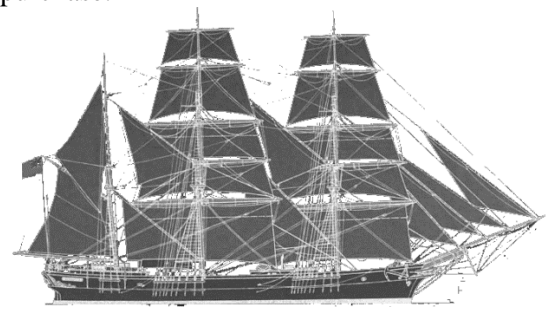
The above illustration shows a barque rigged vessel.

We have no illustrations of the "Hashemy". However we do know that originally she is described by Lloyds as a Ship, but from 1847 onwards as a Barque. In the eighteen hundreds a ship meant she had at least three masts all square rigged. A barque also had at least three masts all of them fully square rigged except for the sternmost one, which was fore-and-aft rigged. Ross & Co evidently changed her rigging at the time of purchase.